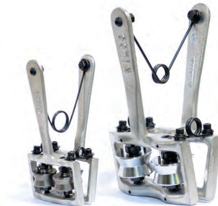
Model LA-CW 1/8" to 5/8" diameter (3.2 to 15.9mm)

At 4 inches wide by 5 inches long (101mm x 127mm), the LA-CW is designed to fit in most ripper boxes. The LA-S is 2-1/2 inches wide by 3-1/4 inches long (63.5mm x 82.5mm) and intended for intermediate boxes or very small ripper boxes.